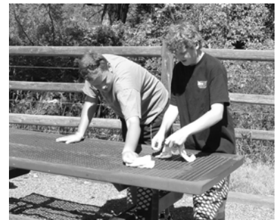
Imagine!'s Stepping Stones project provides teens who have a developmental disability with a learning opportunity that prepares them for work.