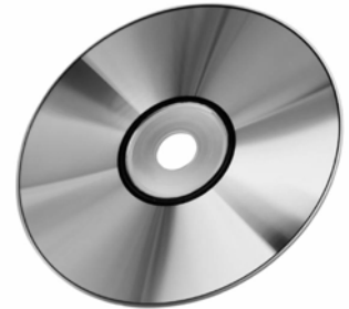
Imagine! is launching a new project to create an oral and video history of Imagine!, and we want you to participate!

We look forward to hearing your story, and we look forward to another 45 years of service!