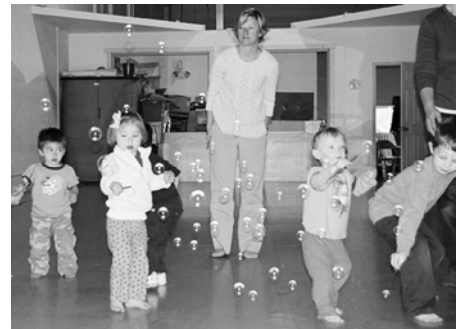
Children and parents, along with Imagine! staff, participate in Dayspring's Community Calendar Activities (CCA) program at venues in the local community. The Foundation has raised nearly $60,000 in grant support for CCA during the past ten years.

The Bob and Judy Charles SmartHome and the Charles Family SmartHome