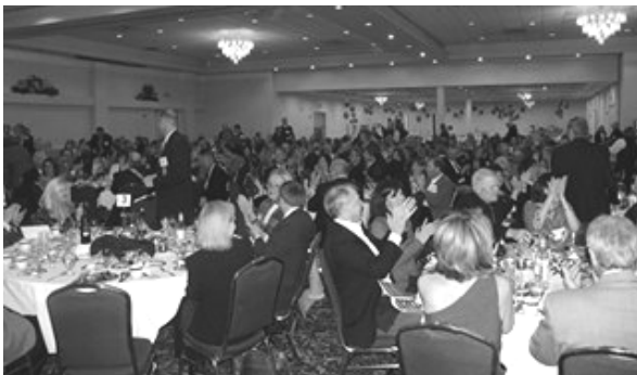
Last year, 360 people attended Imagine!'s premier fundraising event.

Foundation was one of the first non-profits in the area to try electronic bidding three years ago, and it is